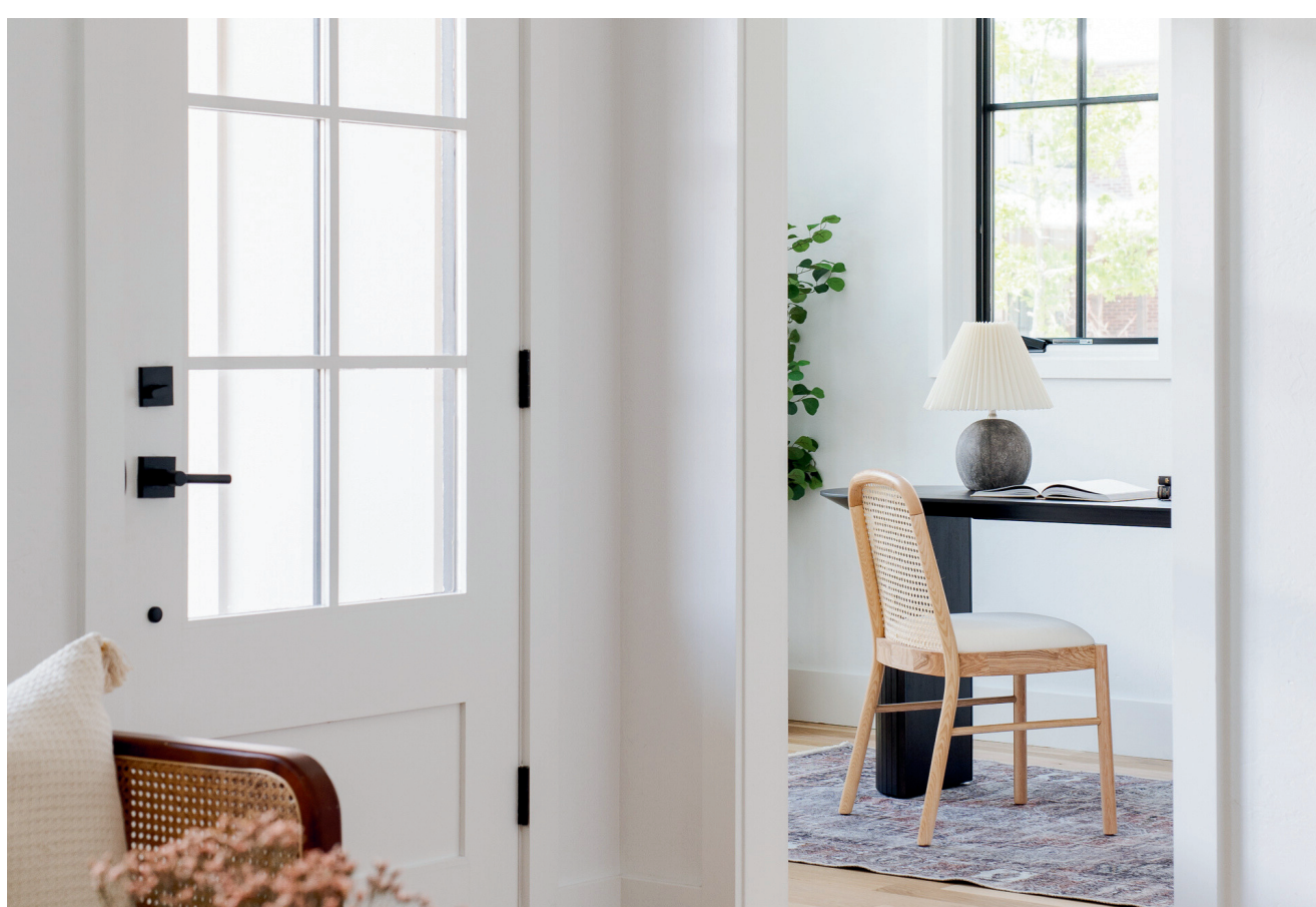
All marketing materials are provided for informational and inspiration purposes only. Prices and fees subject to change.

The beloved Dakota plan just got even better with the addition of a detached garage apartment—perfect for guests or as an investment opportunity. Facing a large shared courtyard, the main house offers 1604 SF of living space, with three bedrooms all located upstairs, while the garage apartment adds an additional 524 SF. The main house includes a study, functional mudroom, utility room, and powder bath on the first floor. Enjoy outdoor living on your large covered porch or or retreat to the privacy of a covered patio in the backyard in Wheeler District.